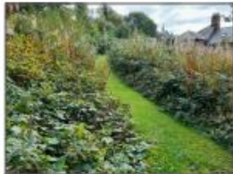
9 Retain mown paths and scrub habitat