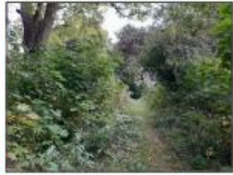
5 Dense bramble and sycamore regeneration - cut back to open views, create useable spaces and reveal grave headstones