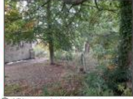
3 Lift tree canopies to create useable open spaces