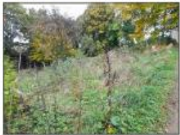
8 Open slope with potential for community orchard and growing spaces