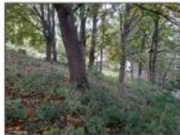
11 Mature trees with understory