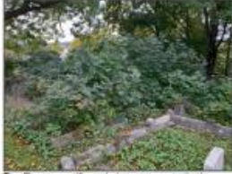
4 Remove self-seeded sycamore and relay grave edging stones to facilitate maintenance