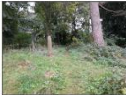
10 Open glades - develop as wildflower meadows