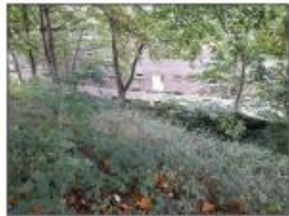
7 Remove large sycamores close to Flats