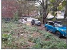
1 Entrance - repair gateway and install new gates and signage