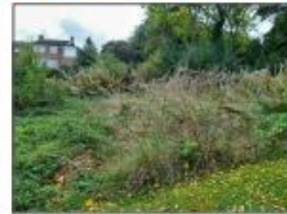
13 Glades with herbaceous habitat - control woody growth to maintain open habitat