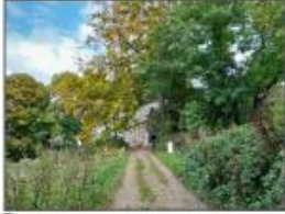
2 Main drive - margins to be kept tidy