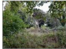
12 Mature trees and shrub layer at south end of site