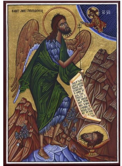
Icon of John the Baptist

First of all, although we find many types of ritual washings in the Old Testament, nowhere do we read about baptism in the same way as we find it here. What seems to get closest to John's baptism is 'proselyte baptism'. This is not recorded in Scripture, but the rabbis describe that if a non-Jewish person wants to become a proselyte (i.e. a practiser of the Jewish faith), this person undergoes a baptism. That baptism symbolises the parting of the old ways. It is a one-off baptism.